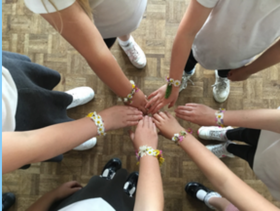
Exploring Nature: Making Nature Bracelets