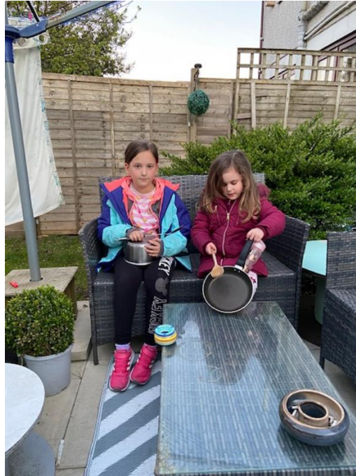
We have been clapping for key workers every week!!