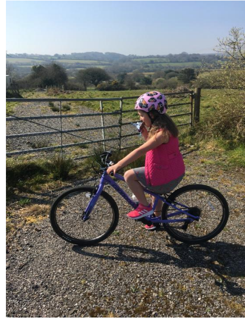
I've enjoyed riding my bike, I've been cycling to check on my granny & grandad most days! Dad says it's nearly 7 miles every time!!!